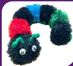
Cecil the Caterpillar Our Reading Buddy