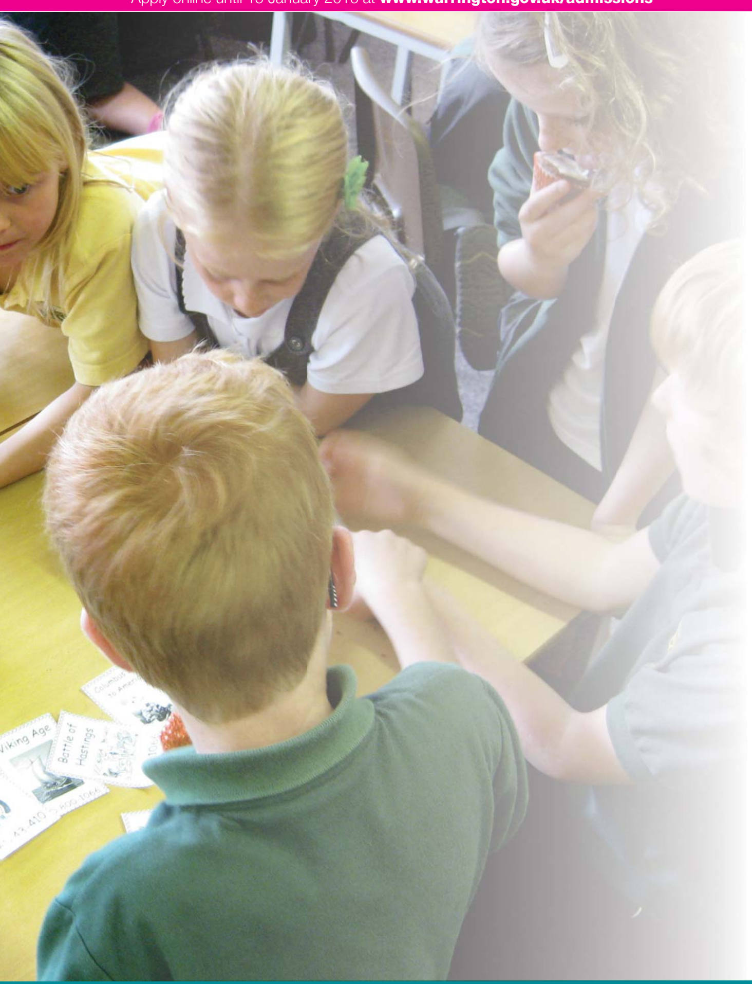
Apply online until 15 January 2016 at www.warrington.gov.uk/admissions