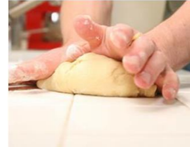
Kneading a bread dough