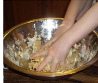
Rubbing in to mix fat and flour if making a yeast-based product