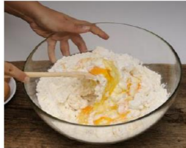
Mixing to combine ingredients if making savoury muffins or scones